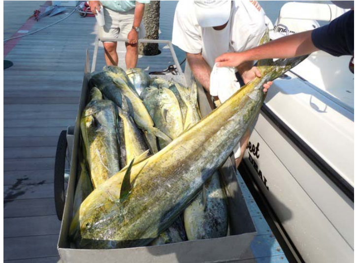
Evidence of good dolphin (mahi mahi) catches

DEEP WATER AND STREAM: DOLPHIN AND KINGFISH – GOOD; WAHOO –SLOW.