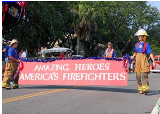
Banner preceding the winning golf cart float.