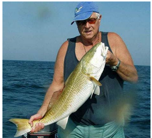
Ralph & Redfish

SCDNR reports that winter fishing looks good, but the only thing this fisherman says is, "Let's have better weather than last year."