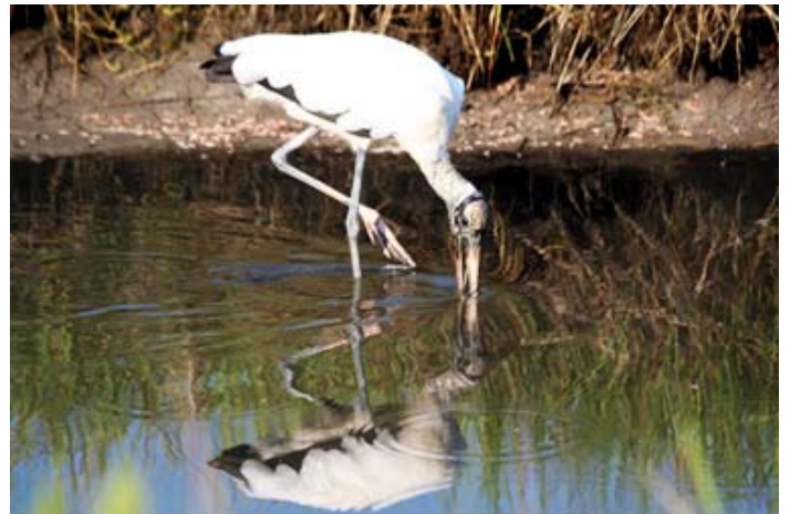
Wood Storks can be seen along Marsh Dunes Road